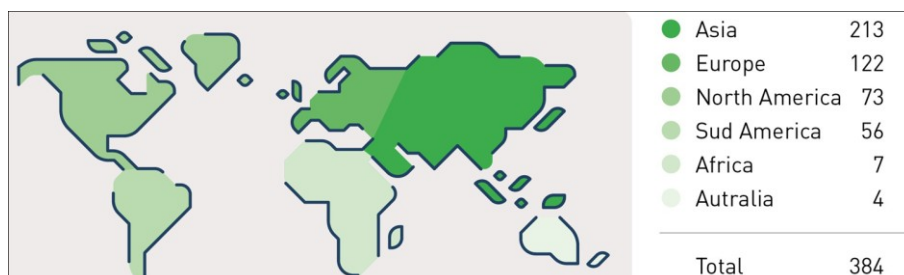
Fig. 1. The total number of articles by continents.

254 255 256 257 258 259 260 261 262 263 264