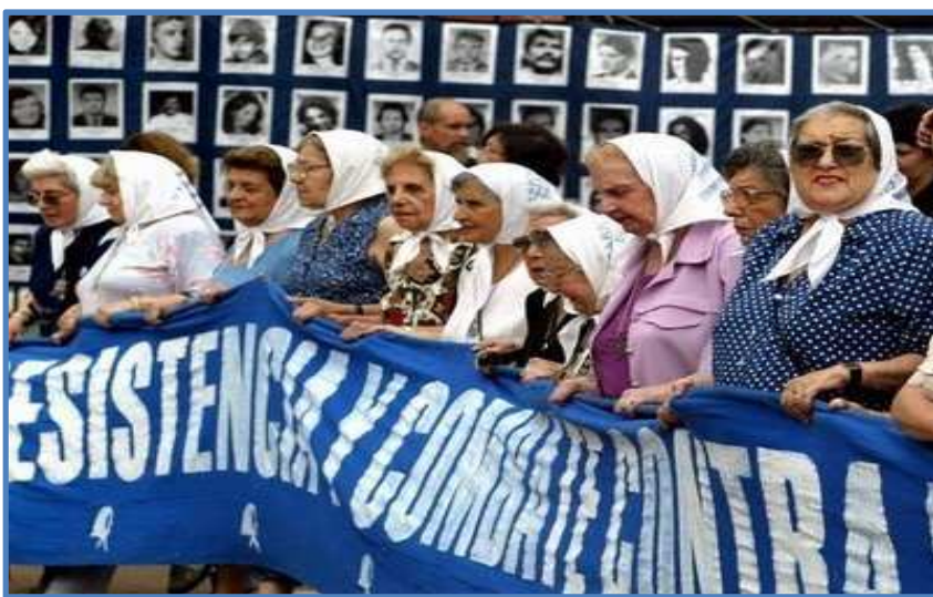
Picture 3: The March of Resistance - Madres Plaza de Mayo (Argentina)

I would like to argue in this third part that if we can better understand the communicative and expressive dimensions of collective actions of victims' group of the global south from a transnational perspective, it is possible to analyse how civil society creates social cohesion, developing a sense of trust and a spirit of collaboration to promote peace, co-operation and reconciliation in contemporary fragile social contexts. My proposition is that the construction of symbols articulating the communicative dimensions of political, social and cultural rights, can help civil society groups and social movements to restore a sense of citizenship and collective belonging. It would also generate processes of construction of social memory, recognition and solidarity from a counter public perspective. In the case of the victims' groups of Eastern Antioquia, the construction of social, historical and cultural memory from a victims' perspective and the implementation of symbols of other victims' groups of the global south is a tool to claim truth and reparation in the midst of the armed conflict.