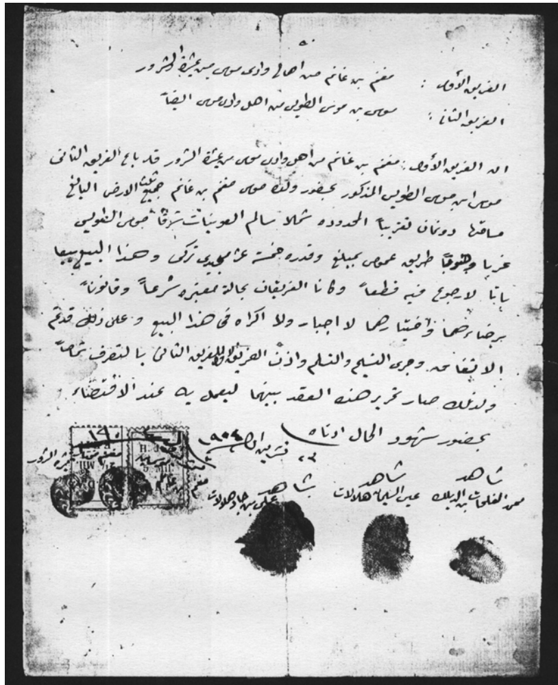
Figure 3 : Document 3