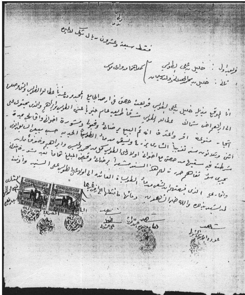
Figure 2 : Document 2